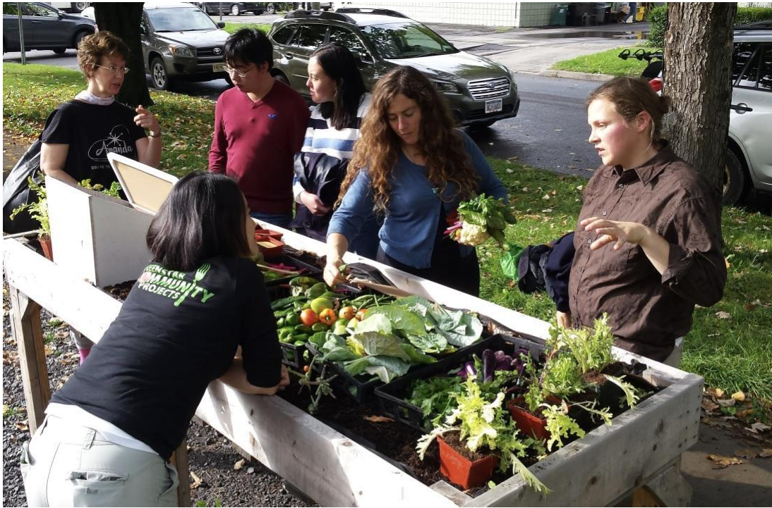
#Food Is Free