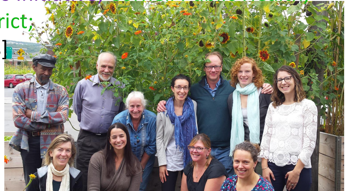
Some members of CNC Steering Committee